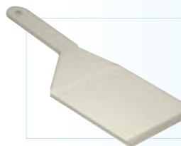
Scoops for safe transfer of gels

With gel tray options of 10 x 7cm and 10 x 10cm, the multiSUB Midi has been designed for routine horizontal gel electrophoresis. Extending only the width of this unit allows more samples to be resolved per gel than the multiSUB Mini without a significant increase in buffer or gel volumes.