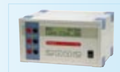
for Power Supplies and Product Selector see page 24/25

A maximum of 100 samples per gel can be resolved making this unit ideal for those routinely checking medium numbers of samples over short to medium gel run lengths.