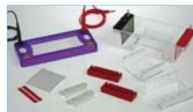
components of multiSUB Mini Duo

Buffer saver blocks physically reduce the volume of a gel chamber and so reduce buffer requirements, saving cost.